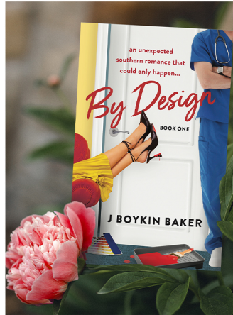
By Design: A Love Story with a Twist