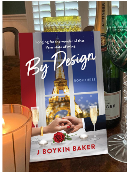
By Design III: A Life Well Lived