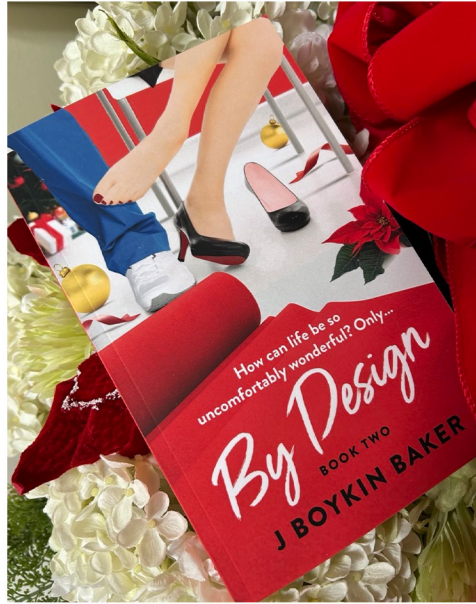
By Design II: Matters of the Heart